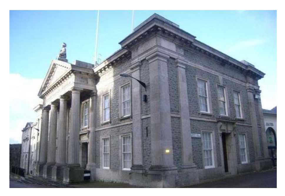
Caernarvon Town Hall.