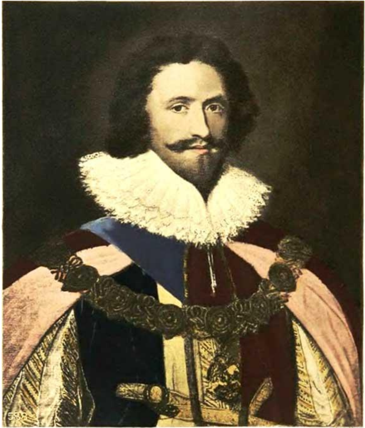
THE DUKE OF BUCKINGHAM