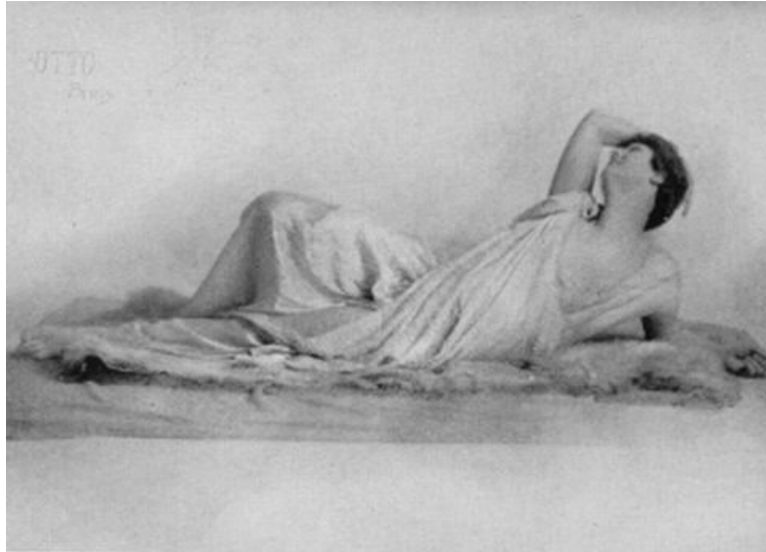
ISADORA DUNCAN, 1911

Duse, with her marvellous instinct, had donned a gown of white with great wide sleeves that fell at her sides. When she appeared, she looked less like Rebecca West than a Delphic Sybil. With her unerring genius, she adapted herself to every great line and to each shaft of light which enveloped her. She changed all her gestures and movements. She moved in the scene like some prophetess announcing great tidings.