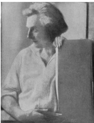
EDWARD GORDON CRAIG

Shortly after, I discovered—and there could not be the slightest doubt about it—that I was pregnant. I dreamt that Ellen Terry appeared to me in a shimmering gown, such as she wore in "Imogene," leading by the hand a little blonde child, a little girl who resembled her exactly, and, in her marvellous voice, she called to me—"Isadora, love. Love. . . . Love. . . ."