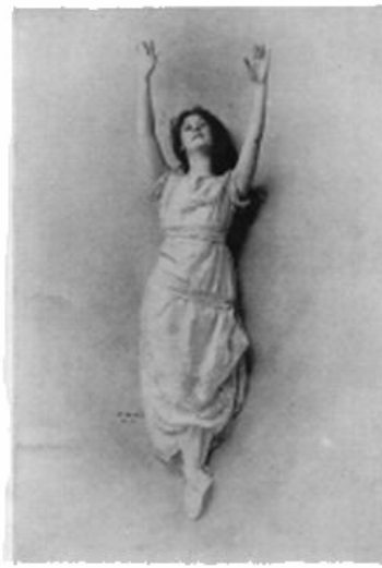
ISADORA DUNCAN: TWO EARLY PHOTOGRAPHS