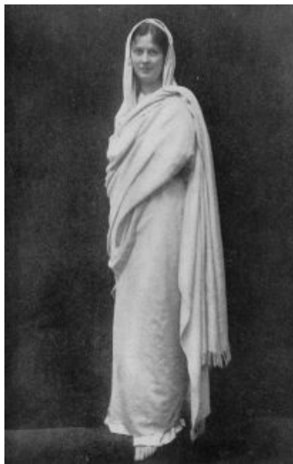
ISADORA DUNCAN (1908)